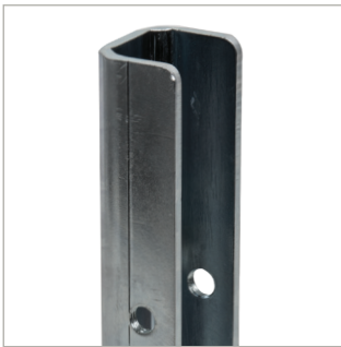
One-piece design for a quick install