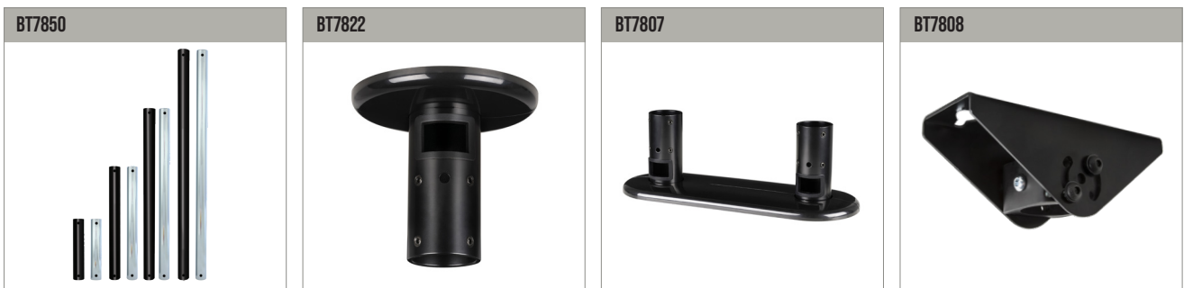
BT7850 Ø50mm Poles up to 3m in length