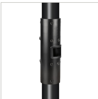
Grub screws which allow micro-adjustment of pole angle