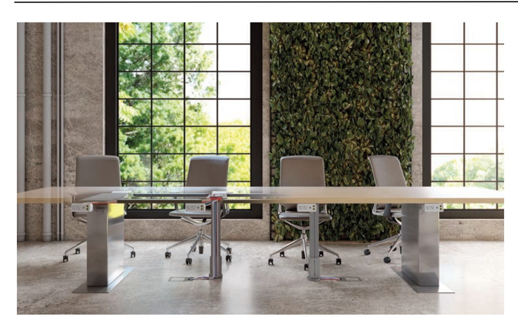
See LIT1665 for details about the Concertto Cable Management system.