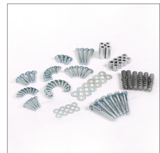
All mounting hardware included