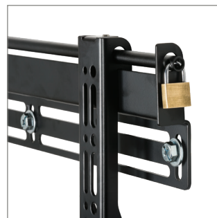
Security locking screws, Allen key and locking bars provided for a secure installation*